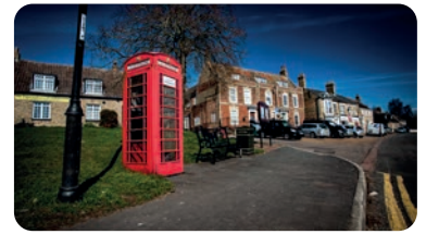
Phone Box Refurbishment Funded by CIL