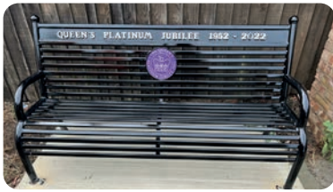
3 Jubilee Benches Funded by CIL