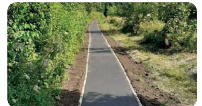
Bury Lane Footpath Funded by CIL

Precept = The Precept is a tax that Parish Council's charge their local electors to meet their budget requirements