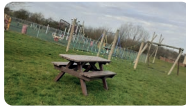
2 Play park Benches Funded by CIL