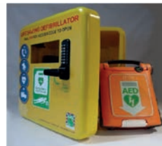
Defibrillator at The Glebe Funded by Precept